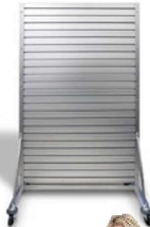
3'x6' Slat Wall