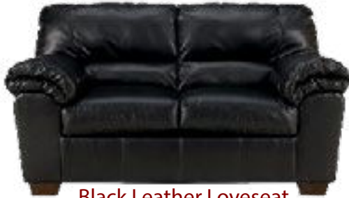
Black Leather Loveseat