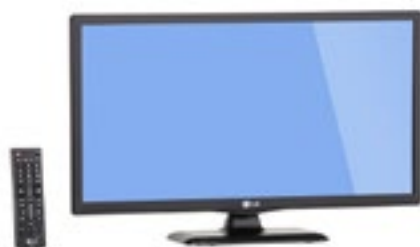
32", 43", 55" and 65" Flat Panel Displays w/Remote