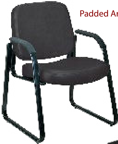
Padded Arm Chair