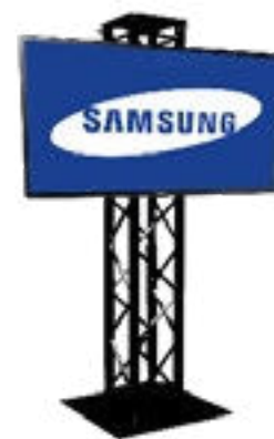
Display Stand (Truss)