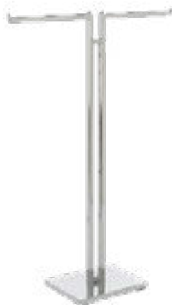
Adjustable T-Rack/ Bag Holder