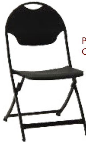
Premium Folding Chair - Black