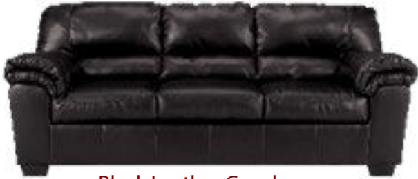
Black Leather Couch